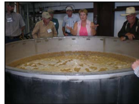
2nd day of production at the Wyoming Whiskey Distillery

For the last portion of the trip, we left the Cottonwood/Grass Creek area and headed down to Kirby, home of the Wyoming Whiskey Distillery. We were extremely fortunate to be at the distillery on the second day of production. The tour was amazing as we were able to view the production (second day in!) and the eventual storage room. Did you know that all the ingredients used in the making of the Whiskey comes from Wyoming! Though some were saddened by the unavailability