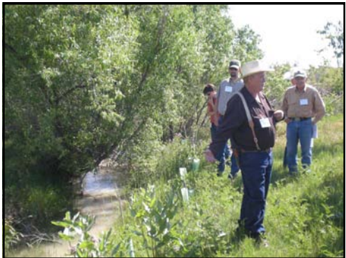
Looking at cottonwood restoration on a creek at the LU Ranch.

Along the way, several stops were made to look at efforts being made by landowners on Cottonwood/Grass Creek to clear Tamarisk and Russian Olive infestations. In October of 2005, landowners formed a Coordinated Resource Management Area (CRM) to develop an integrated weed management program. The objectives of the program were to identify and map invasive weed species throughout the watershed, identify best