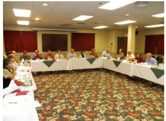
Tuesday evenings winter WWA board meeting.

Friday morning’s discussions included an examination of Pavillion, Wyoming Stream Law, and Improving Stream Flows for In channel benefits. The educational seminar ended on Friday the 28th at noon with everyone excited for next year’s annual meeting and educational seminar in Rock Springs!